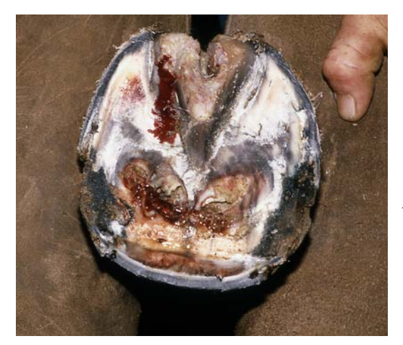
Figure 4: A severe cases of laminitis with distal phalanx rotation and subsequent penetration of the sole.

As the disease progresses and hoof growth is altered the hoof shape changes. As the laminar degeneration occurs the coffin bone rotates away from the hoof wall. The pressure on the sole from the distal edge of P3 causes the concave sole to become flat. In extreme cases the distal phalanx penetrates the sole with necrosis of the solar lamina and eventually damage to the coffin bone (Figure 4). As the hoof attempts to heal and grow, the new hoof wall continues to grow separate from the bone. There is decreased hoof growth at the toe causing a dishing of the hoof wall (Figure 5). In these cases the horse continues to have pain and lameness and the foot grows abnormally until corrective measures are taken.