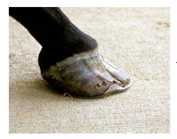
Figure 5: Chronic laminitis with increased hoof growth at the heels and dishing of the front of the hoof wall due to the separation of the lamina from the distal phalanx.