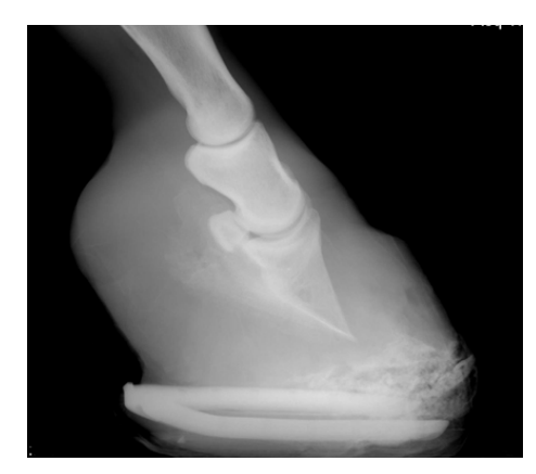
Figure 3: Radiograph of the hoof showing the front of the coffin bone(distal phalanx) no longer in parallel alignment with the front of the hoof wall. The new hoof growth is abnormal.

degeneration of the lamina at both the toe and heel, the coronary band recedes below the level of the hoof wall.<sup>30</sup> In the case of sinking of the distal phalanx, since there is no rotation, the coffin bone often appears in normal position on radiographs. Measurement from the outer hoof wall to the dorsal border of the distal phalanx should be from 1.5 -1.7 cm both at the proximal edge and the tip of the bone (for the average sized thoroughbred). Measurement greater than this indicates ventral displacement (sinking) of the distal phalanx.