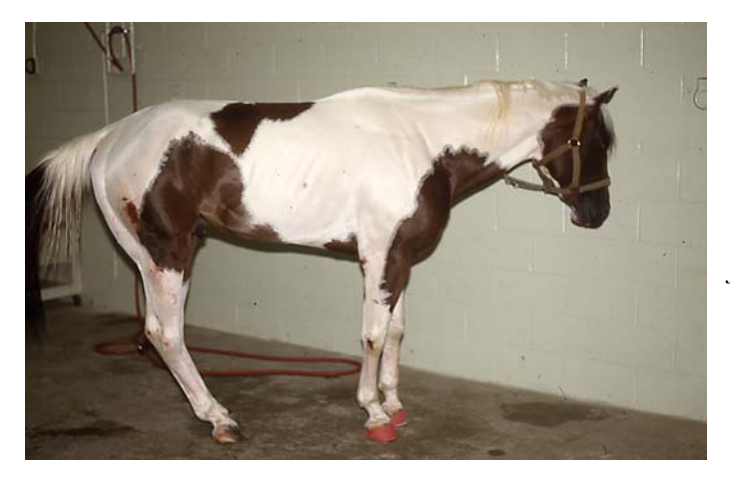
Figure 2: A horse with acute laminitis standing with the rear limbs under the body and the front limbs back underneath the body.

The front limbs can either be placed out in front of the body in an effort to decrease weight bearing or moved back underneath the body (standing on a dime) with flexed limbs to reduce tension on the deep flexor tendons (Figure 2). The back and gluteal muscles are tense and the horse never looks comfortable. While walking horses land on