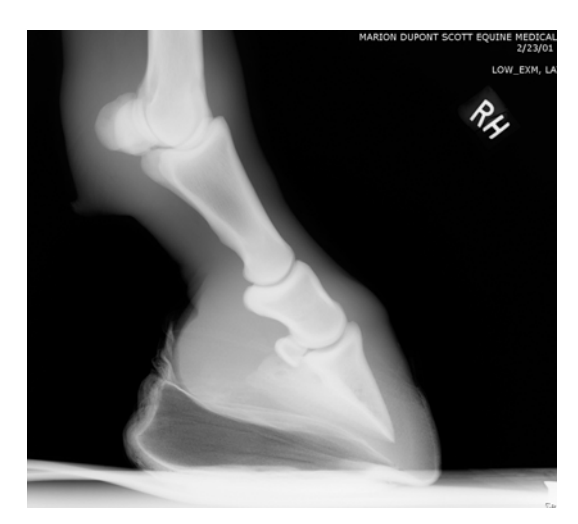
Figure 6: Elevation of the hoof angle with a soft pad helps relieve tension on the deep digitial flexor tendon and reduces concussion.

Some horses have relief by elevating the heels 15-20 degrees with plastic pads (Figure 6). The horse's feet are left at this increased angle if there is relief of pain.